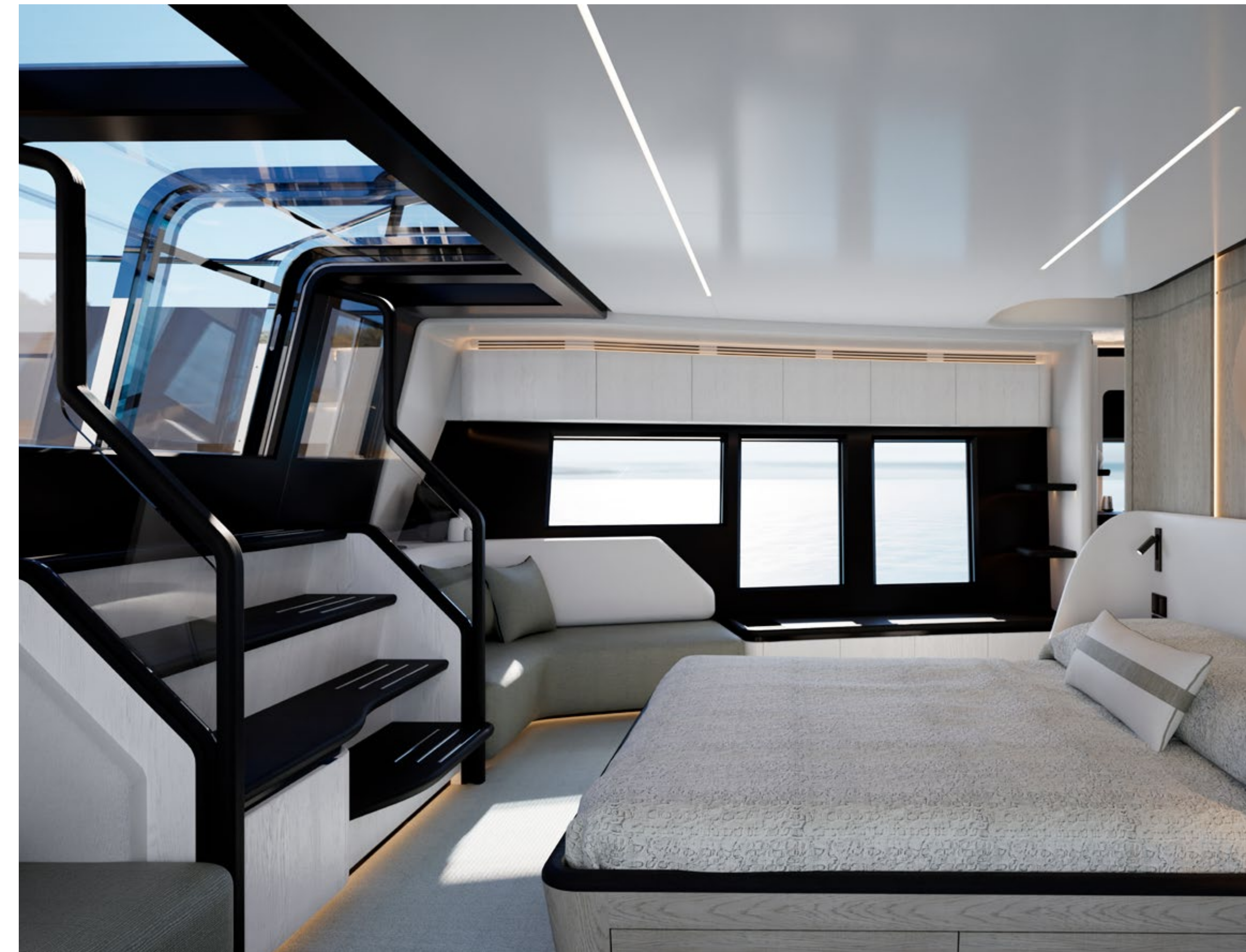
MAIN DECK MASTER