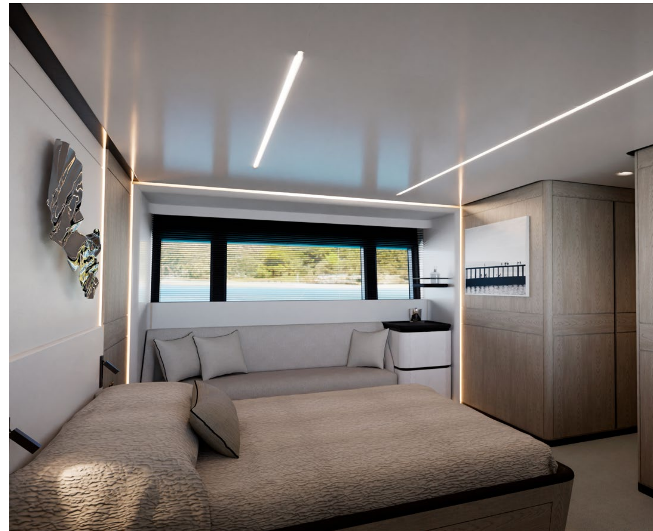
MID SHIPS MASTER