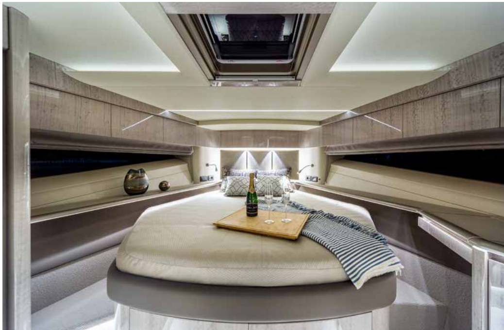
The upper glazing beautifully illuminates the guest cabin during the day