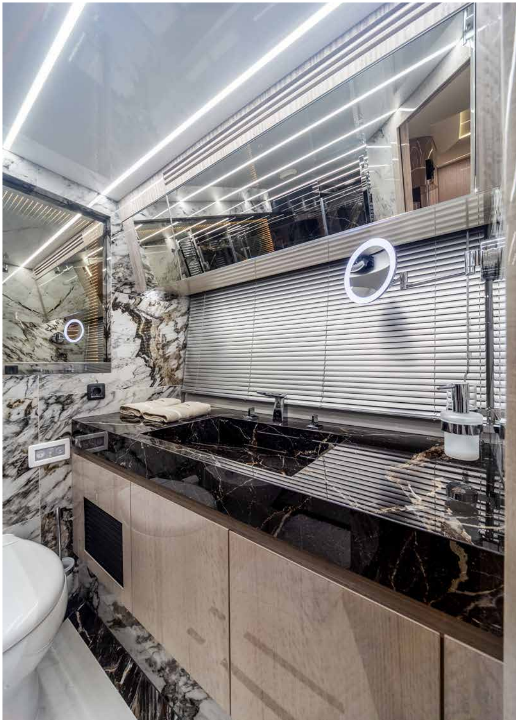
— Unique bathroom finish with modern elements