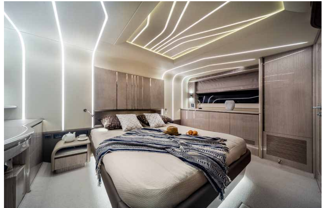
Owner's cabin with private access to the bathroom