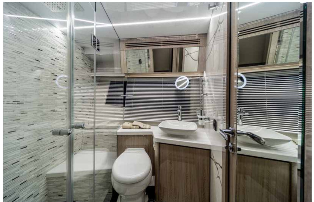
— In each bathroom you can stand freely and each has a separate dry area