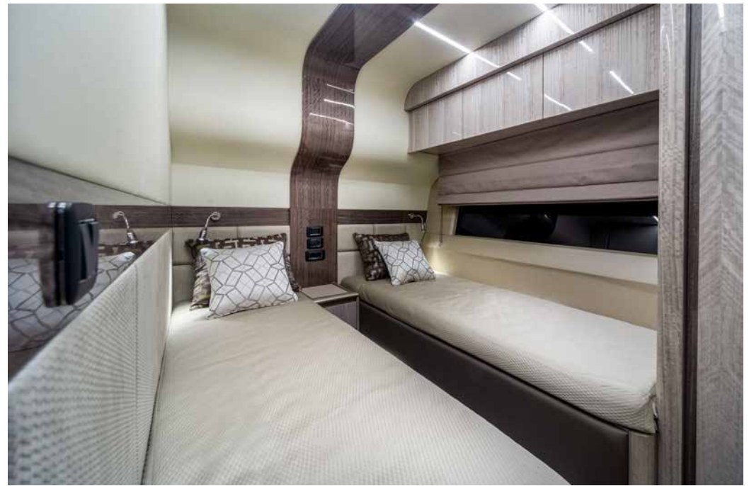
— One of the two cabins with two beds for guests