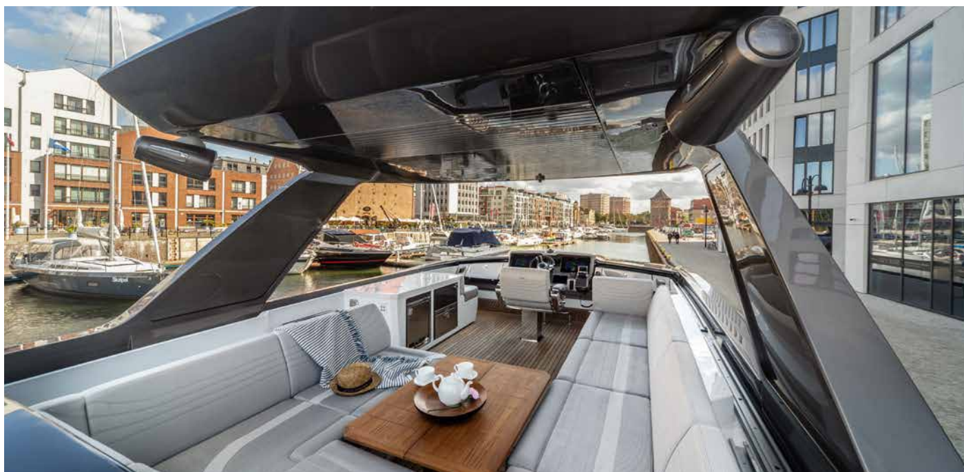
A vast expanse of flybridge