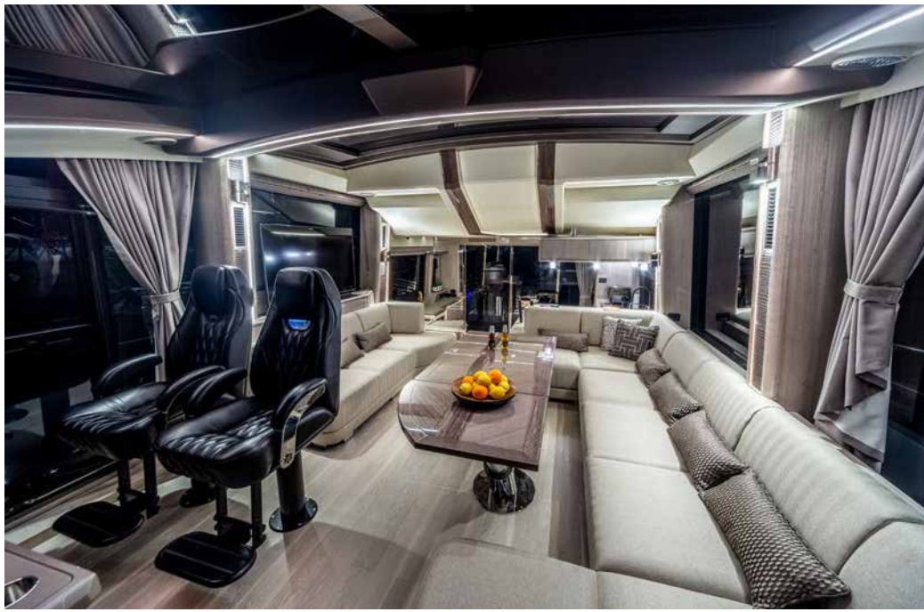
Interiors designed to relax