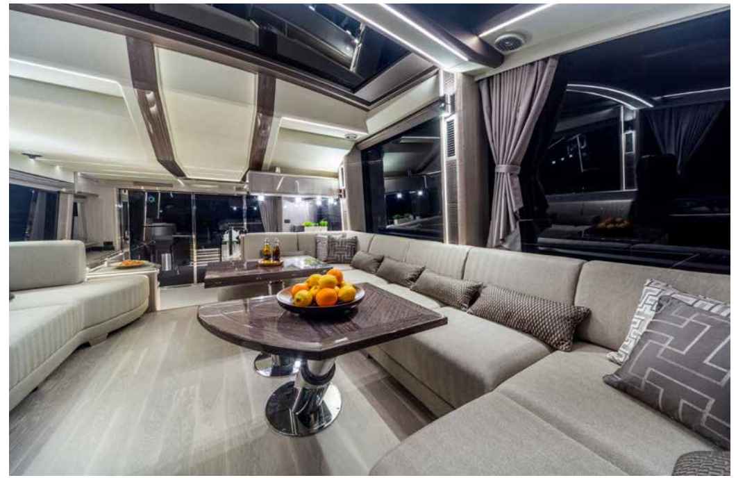
The elegant lounge is perfect for receiving guests