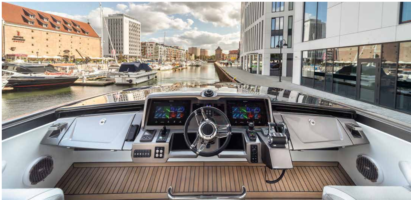
A beautiful view from the helmsman's upper station