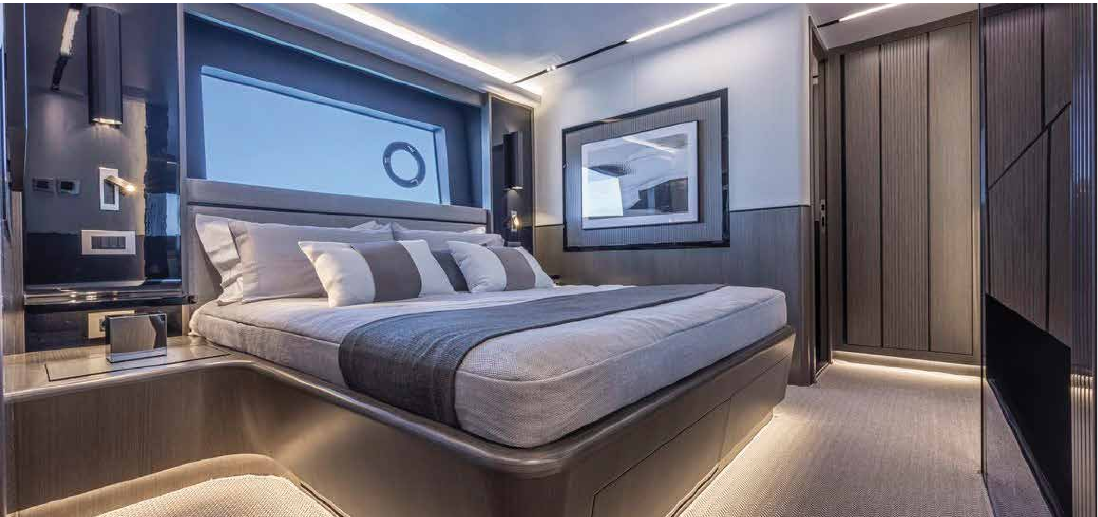
GUEST STATEROOM 1