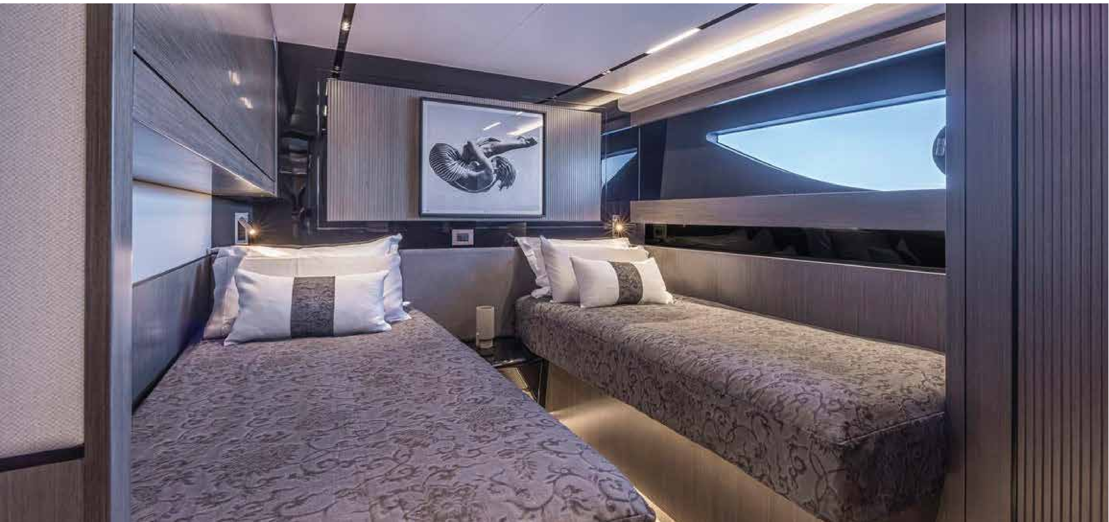
2X TWIN STATEROOMS