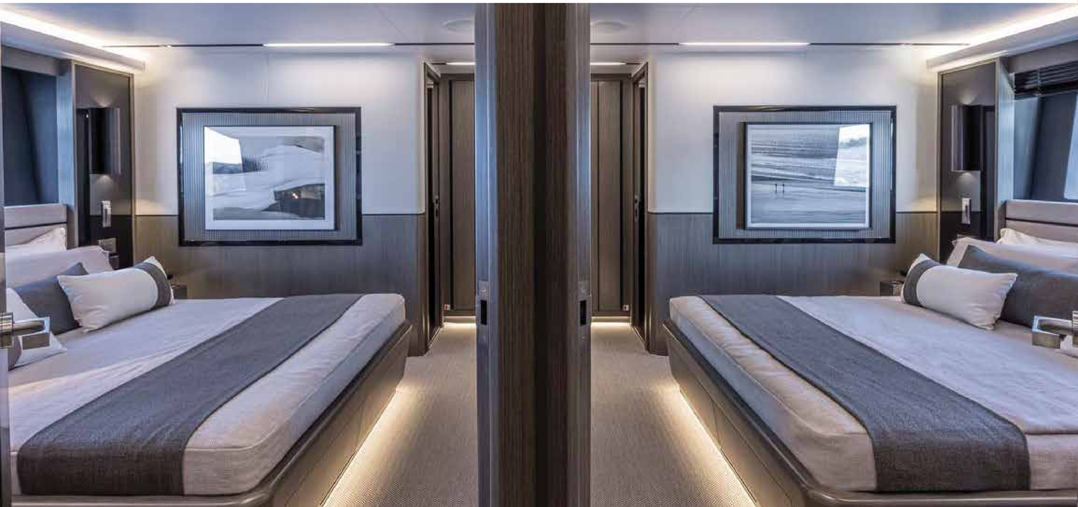
GUEST STATEROOM 2