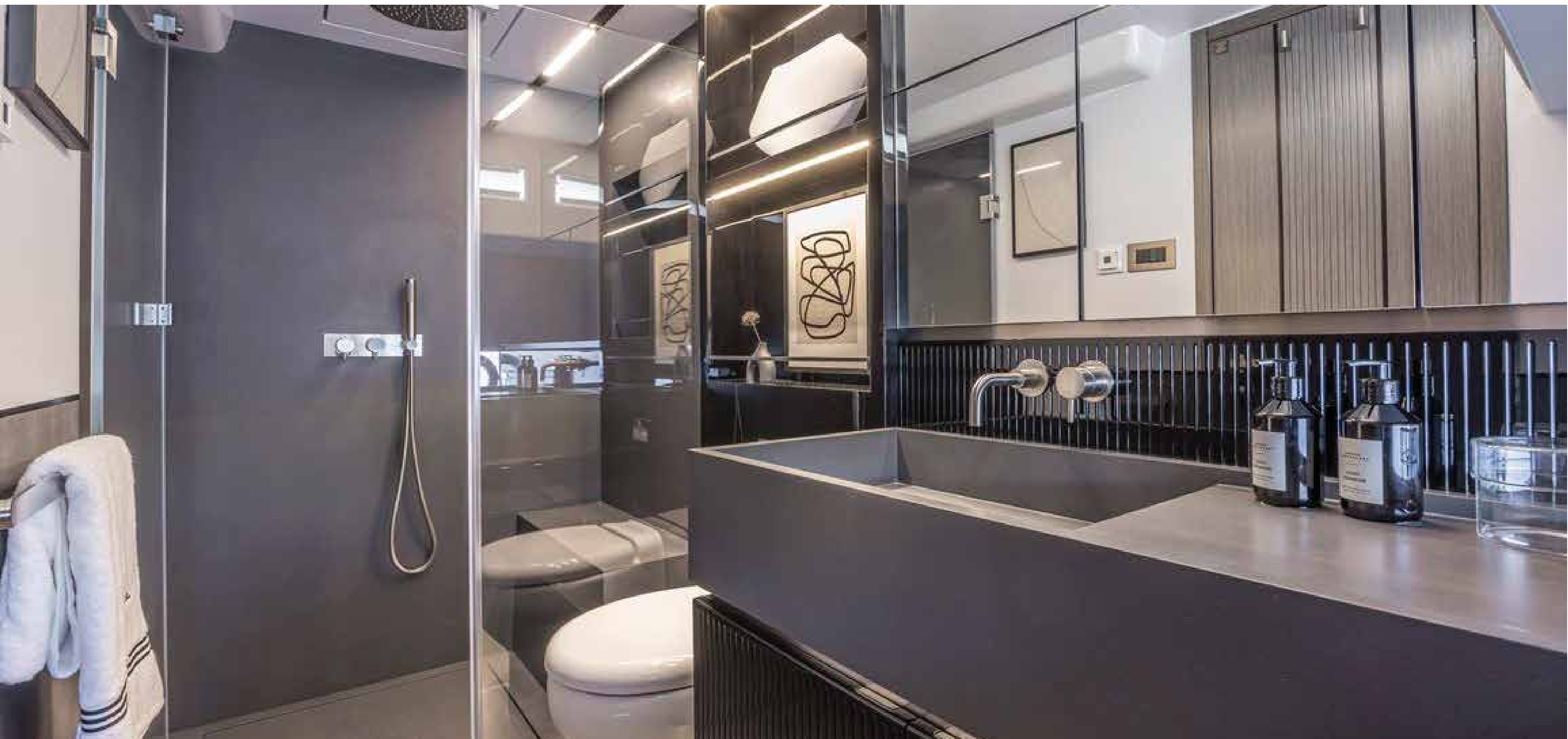
MASTER STATEROOM EN SUITE